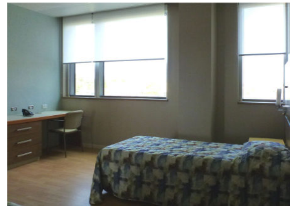
A semi-private room.

When there is space available, a companion (spouses, partners or friends that would like to stay with the patient) will need to pay a fee of $45 per day. Companions must be willing to give up their space should another eligible patient require the bed.