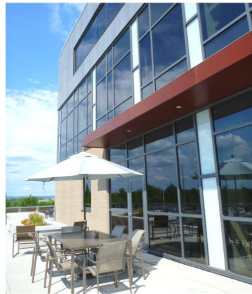
Outdoor patio (available during summer months).

After your Care Team confirms you have met the requirements and completes the referral form, you will be accepted as a guest on a first-come, first-served basis.