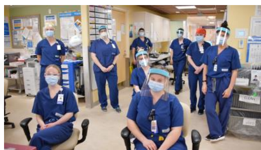
Nurses on the Respiratory Inpatient (COVID-19 unit).

In 2020, the Board of Directors made the unanimous decision to bestow its highest award to the entire team at RVH for its collective, outstanding response during the pandemic. Outdoor benches were purchased and placed around the campus in appreciation and recognition of TEAM RVH.