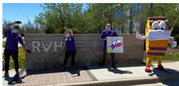
TEAM RVH gets ready for the Rotary Fun Run.

In 2020, there were 455 named memorial efforts raising approximately $100,000.