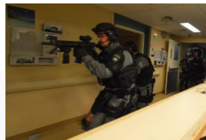
Mock Code Silver training at RVH