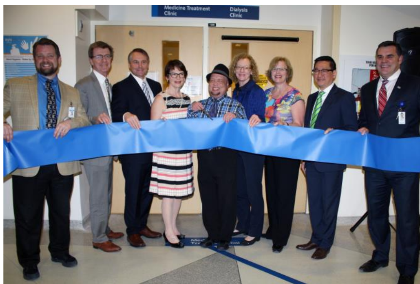
The ribbon cutting celebration during the opening of the in-hospital Dialysis clinic.

RVH hosted its own Advanced Cardiovascular Life Support (ACLS) Instructor Course. RVH now has 13 certified instructors, including clinical educators, physicians and registered respiratory therapists, who are able to teach important life-saving skills to others.