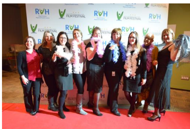
The Cardiac Renal team celebrated victory at the Vickies.

RVH's fourth annual Film Festival, themed 'Safety is our promise', wrapped up with The Vickies awards ceremony. This year, the Film Festival received seven entries from one clinical and six non-clinical teams. Awards were handed out in three categories – MY CARE (to the Renal program), Most Creative (tie between Health Information Management/Decision Support and Occupational Health & Safety) and People's Choice (Patient Food Services). RVH also opened up the film festival to schools in the region and received two entries based on the theme 'What does RVH mean to us?' Unity Christian High School and W.R. Best Memorial Public School were presented with awards at The Vickies for their participation.