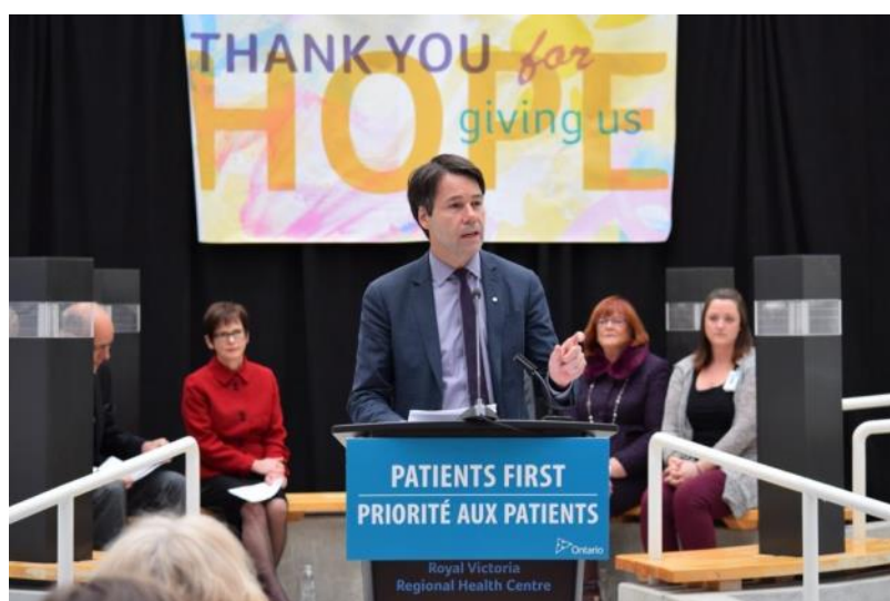
Ontario Minister of Health and Long-Term Care Dr. Eric Hoskins visited RVH for Child and Youth Mental Health announcement.

The provincial government invested $3.2 million in annual operating funds for a Child and Youth Mental Health program at RVH. Construction is now underway and scheduled to open in late-2017. The eight-bed unit and day program will provide mental healthcare for up to 300 children each year. A day hospital will provide care for troubled kids through 3,000 annual visits.