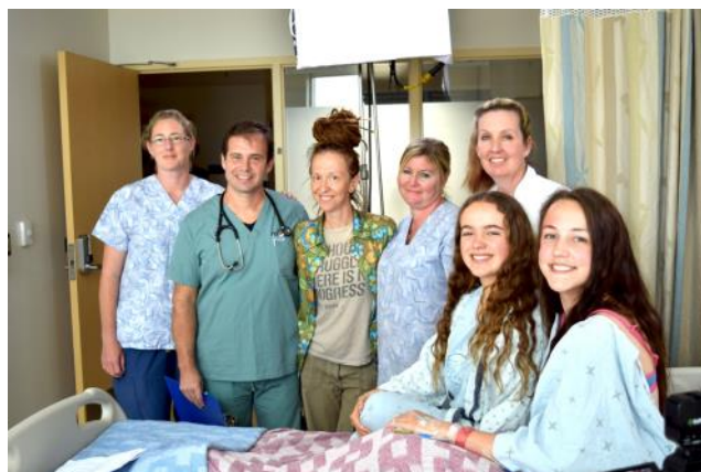
RVH acts as a movie set for the film Porcupine Lake .

This year RVH welcomed 25 staff and three physicians into the Quarter Century Club, for those with 25 years of service. This brings the total to 678 members.