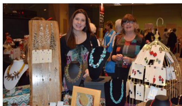
RVH Holiday Market