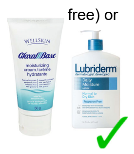
Photo of Lubriderm<sup>®</sup> and Glaxal Base<sup>®</sup> Moisturizing Cream.